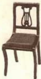
Lyre-Back Chair Circa 1800

This chair is typical of the graceful designs of the New York cabinetmaker, Duncan Phyfe in the early part of the 1800's. The design of this chair was his interpretation of the Directoire made during that period when the American taste was being influenced by French designs.